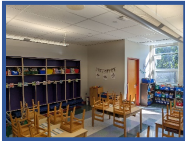
TBS WHS HBS Bathrooms

For more information, please refer to this recent presentation provided to the Board and public which includes photos of the completed renovations. See a few of the photos below: